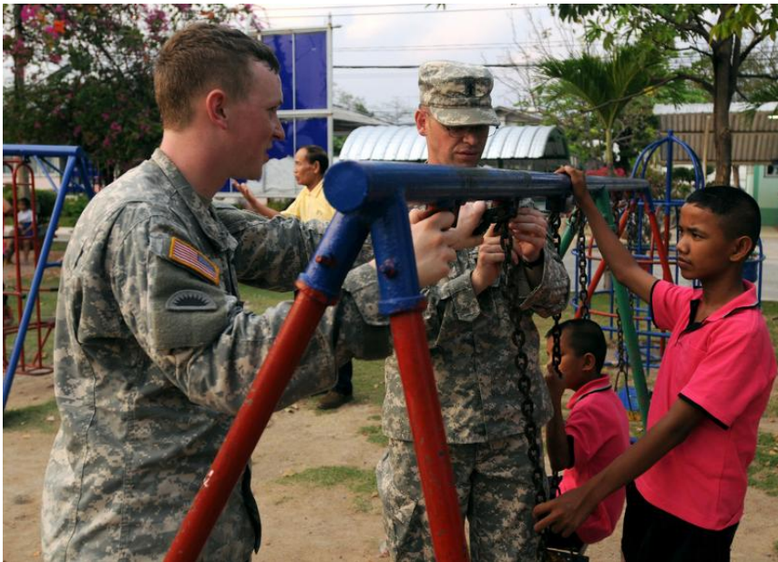
Thailand: Army Guard Soldiers visit home for abandoned youth in Nakhon Ratchasima