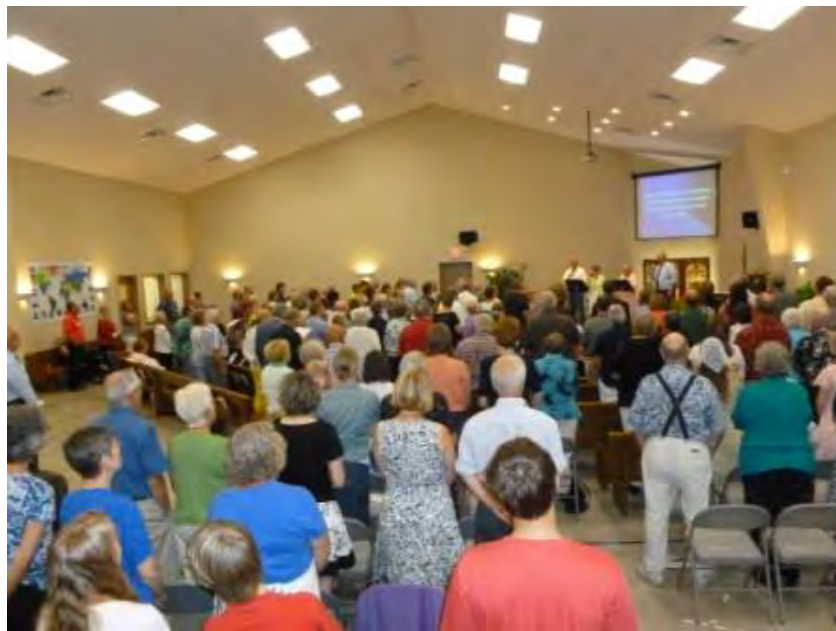
Celebrating 150 years!

Faith Community Church in West Concord, Minnesota, held its 150th anniversary July 21.