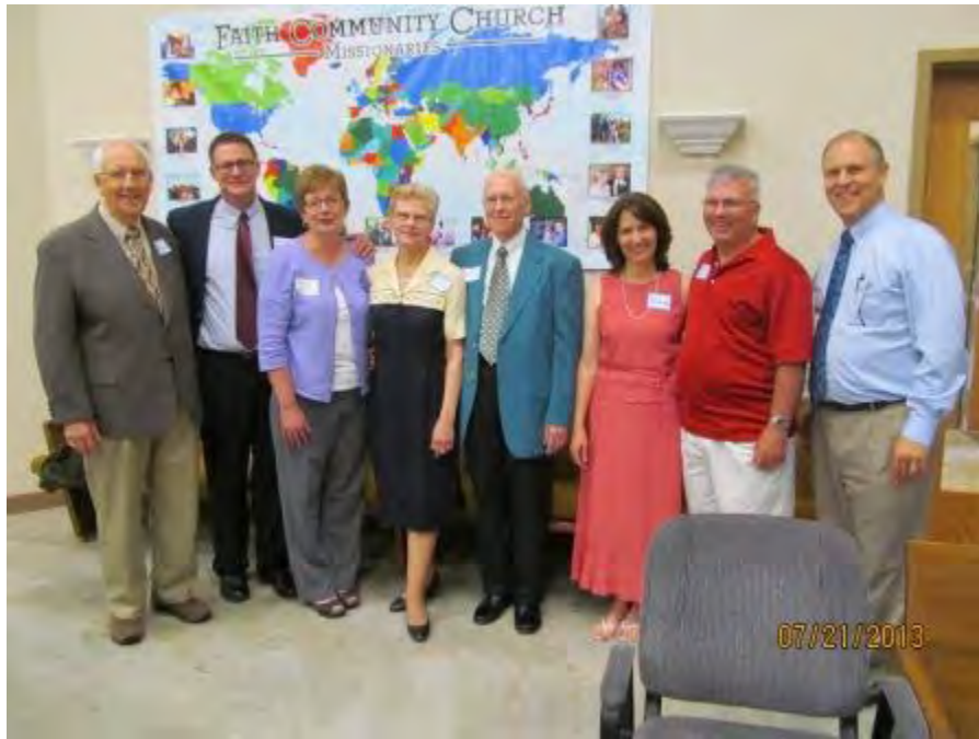
Kanangeiter (1950's), Phinney (1990's), Phelps (1970's), Breederland, current, Paulson (missionary)